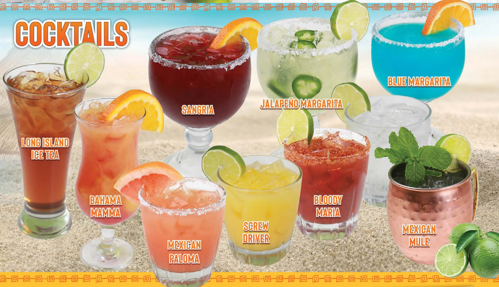
LONG ISLAND ICE TEA